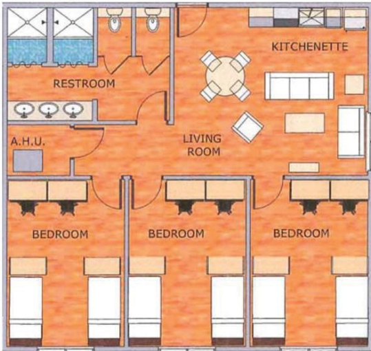
3 Bedroom Pod Houses 6 Residents