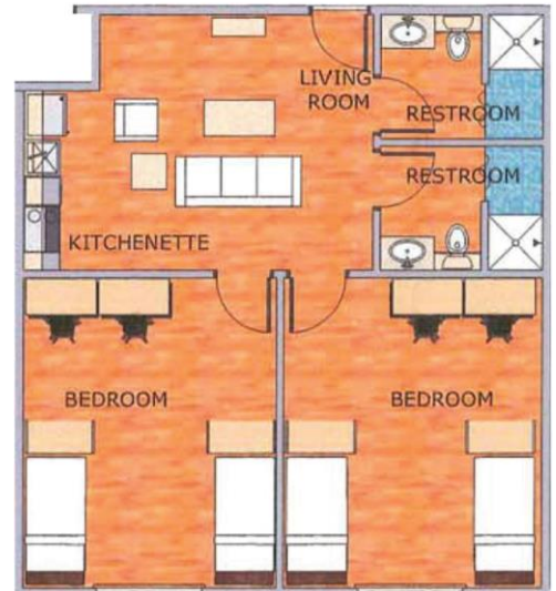
2 Bedroom Pod Houses 4 Residents