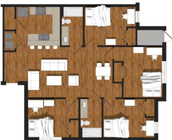
Four Bedroom Apartment Two Bathroom Floor Plan