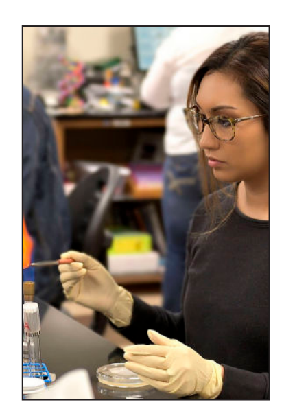
ENGINEERING & SCIENCE